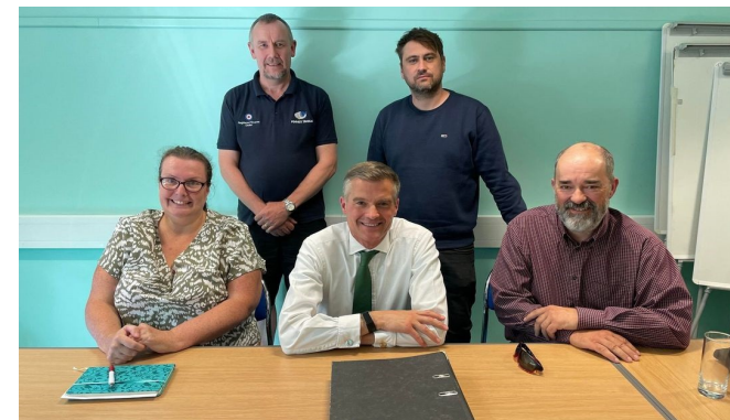
The current Minister for Transport meeting with the Team, has publically declared his support for retaining the ponds