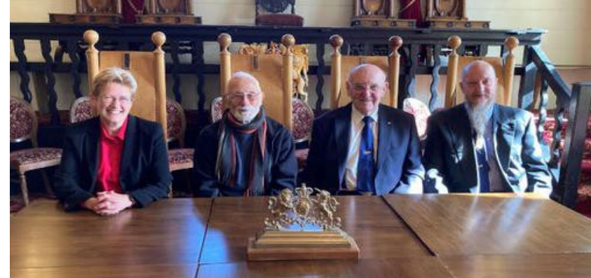
The body charged with overseeing the Sovereign's interests in the Forest – one of the oldest legal entities in the world founded at the time of the Norman Conquest