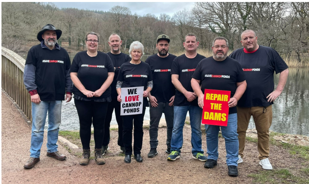
Members of the council and Save Cannop Ponds Team in #savecannopponds t-shirts